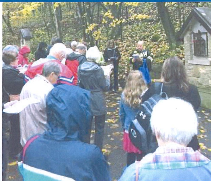
Parish Pilgrimage to La Crosse, October 14